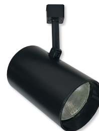
NTH-102B/A Black Finish