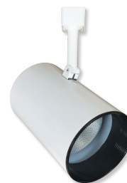
NTH-102W/A White Finish